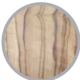
Sevilla Olive (01)