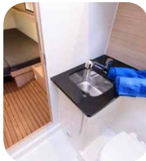
Each cabin has its own en-suite bathroom