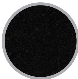
Absolute Black (03)