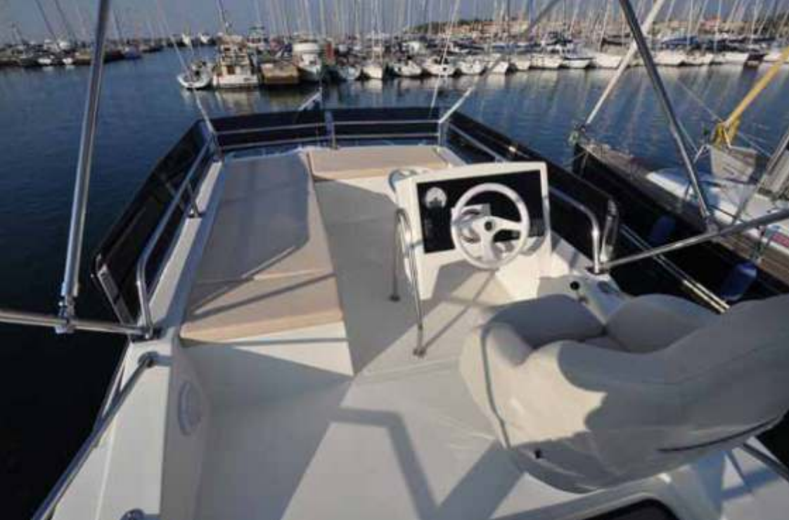
Ergonomic and spacious fly deck.