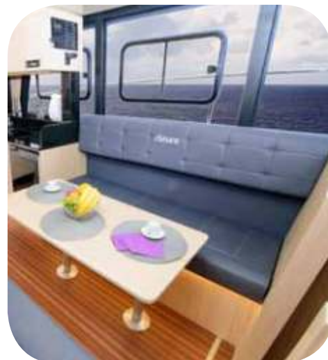
Comfortable and large sofas