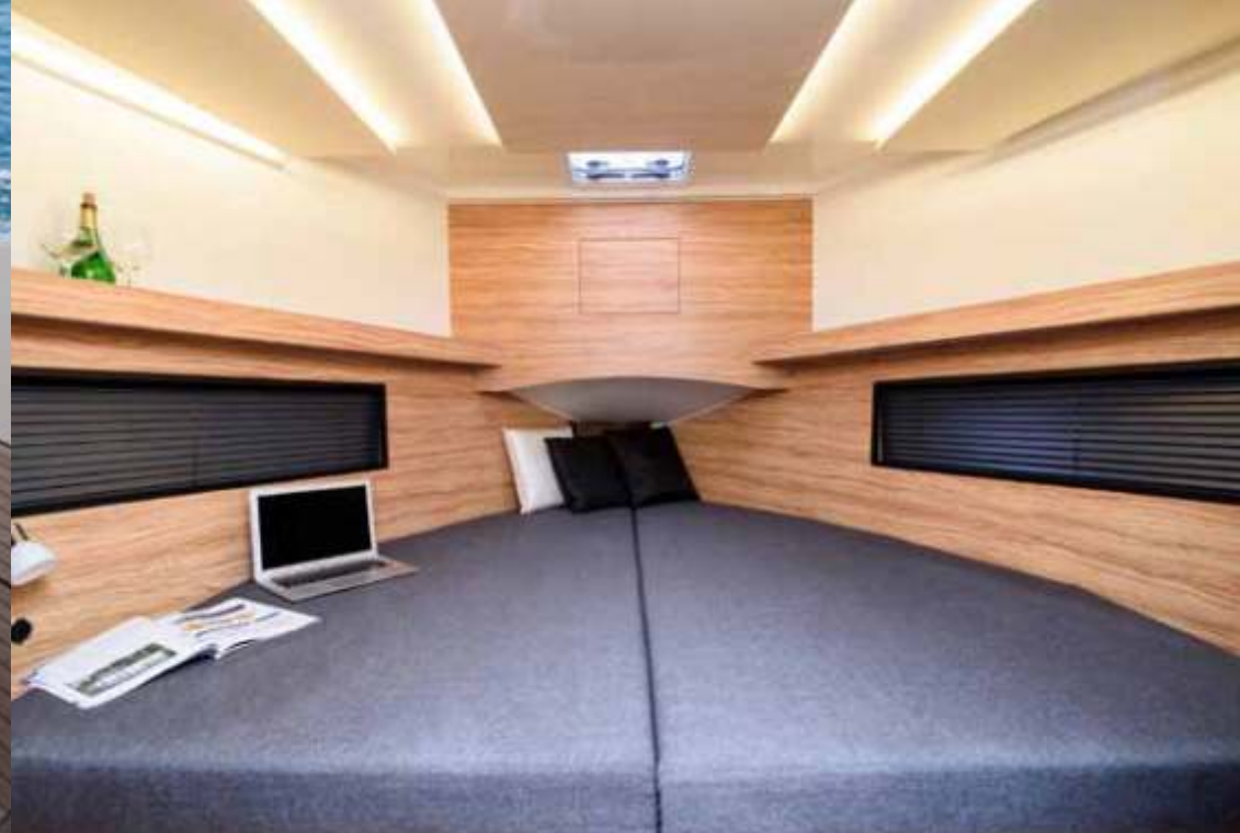
Each cabin offers comfortable berths with hanging lockers and storage.