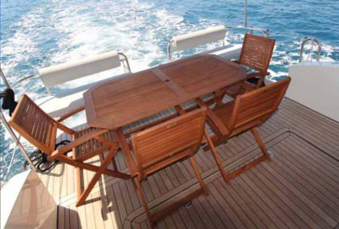
Plenty of open space in the large cockpit and platform.