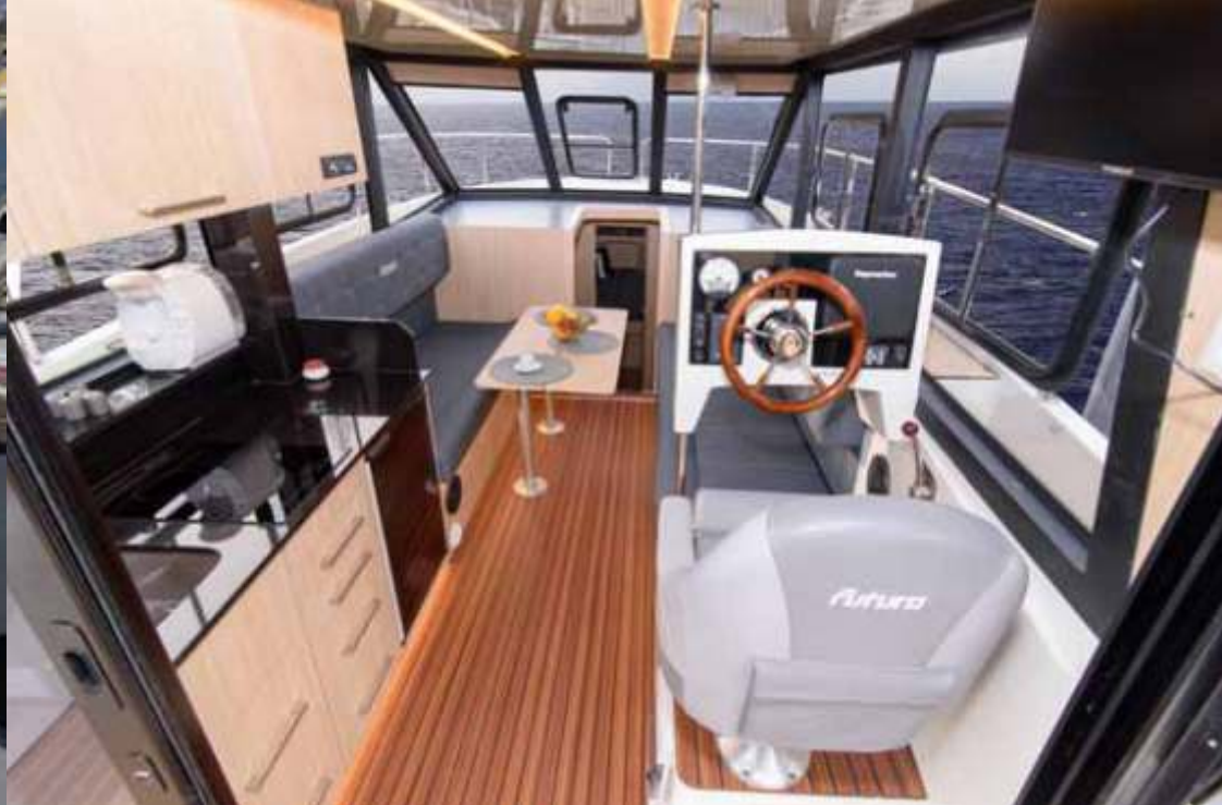
Saloon layout allows the whole crew to spend time together whether you are dining or cruising.